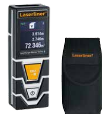
Touch screen for switching functions

LaserRange-Master T4 Pro inclusive softbag + batteries (2 x 1.5 V type AAA) Packaging dimension (W x H x D)