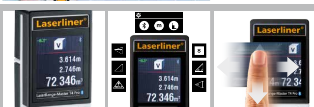
Illuminated colour LCD

* See operating instructions for specific accuracies